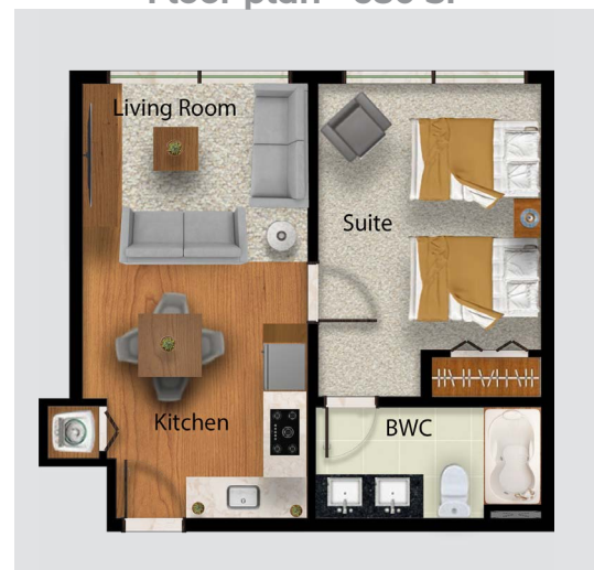
Floor plan - 680 SF

Phone : +1 (407) 602-1700 | Email : info@sycamoreorlando.com