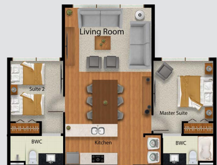
Floor plan - 1248 SF

Phone : +1 (407) 602-1700 | Email : info@sycamoreorlando.com