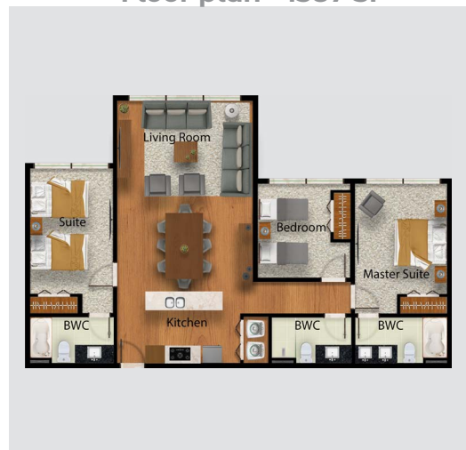
Floor plan - 1387 SF

Phone : +1 (407) 602-1700 | Email : info@sycamoreorlando.com